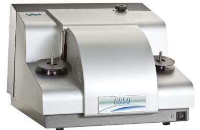
8800-Series Microfilm Scanner

By separating the capture process from the QA routine, VSS optimizes the creation of digital images from microfilm and microfiche. Flexible enough to integrate with existing workflows, VSS provides a powerful toolkit that allows every image scanned to be checked and adjusted before outputting a final saved image. The VSS solution enables the speed of the scanner to be maximized at all times, while the throughput of the QA process is adjusted quickly and easily according to demand.